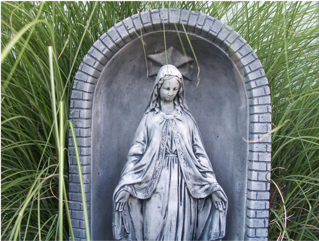
Our Lady Star of the Sea